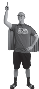
MEGA Point Action