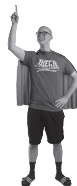
MEGA Point Action