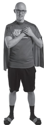
Theme Word Action

If there are kids present from another camp, ask one to come up, give MEGA a high five or a hug, and explain to everyone who MEGA is and what he does.