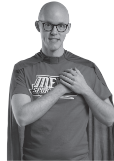
Theme Word Action